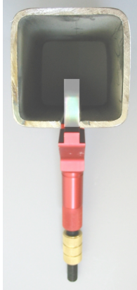
Step 1: Insert until base fits securely into track opening