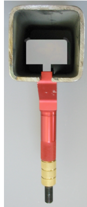
Step 2: Push bolt upwards and rotate 90 degrees