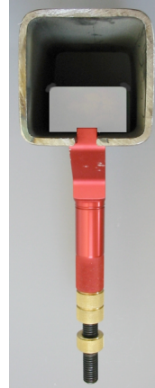
Step 3: Secure a. Release bolt so that head comes downward to seat on riding surface of the track b. Tighten barrel nut to lock TITAN in position